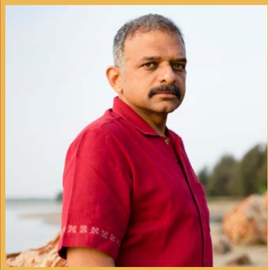
Speaker Shri T.M Krishna Indian Vocalist and Author