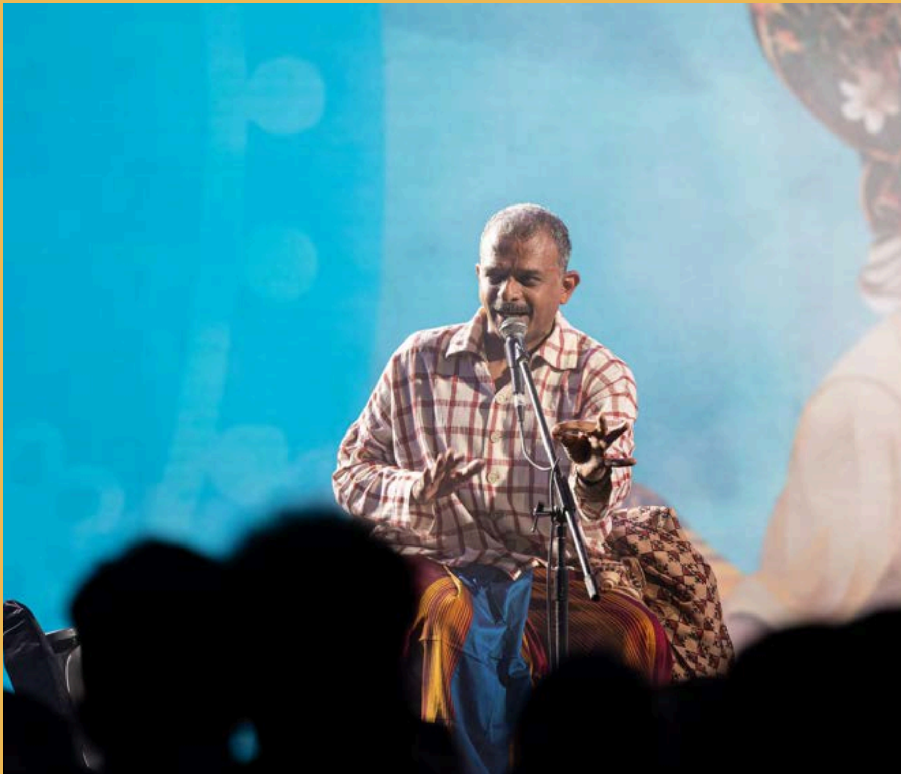
Shri T.M Krishna Indian Vocalist and Author