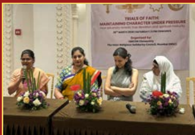
Thematic Panel Discussions