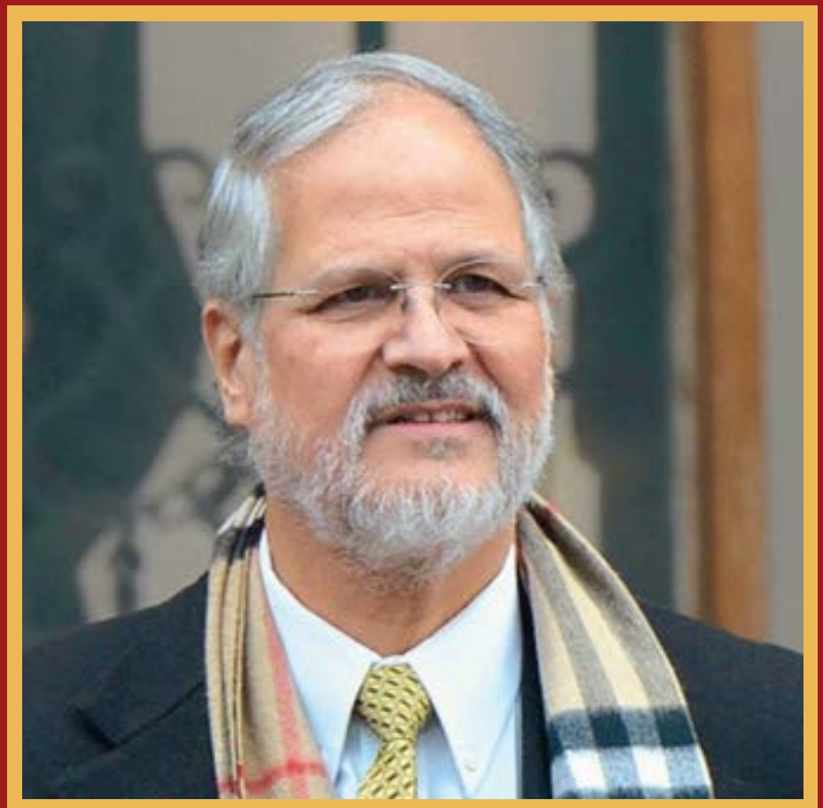
Chair Najeeb Jung Former Lieutenant Governor of Delhi