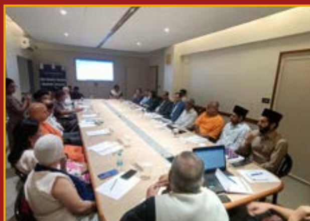
Interactive Dialogue Sessions